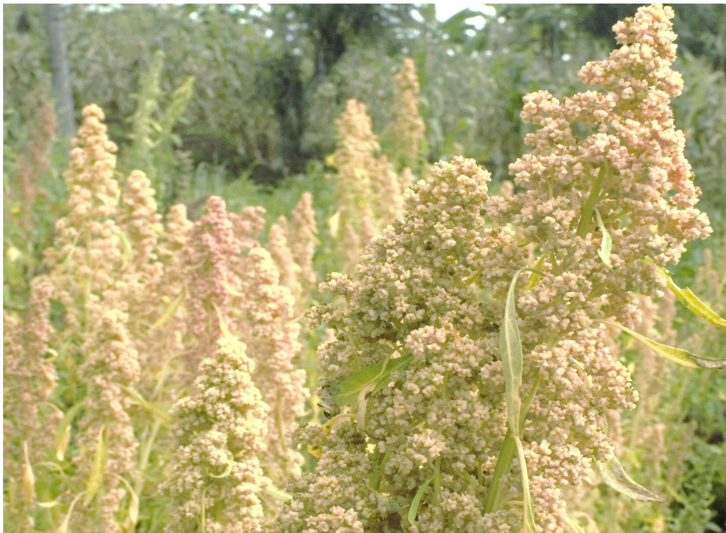
Figure 1. Shisha at maturity stage

‘ S hisha’, in Kinyarwanda means to flourish. Farmers in Rwanda chose this name because quinoa has improved their lives and the lives of their children and helped them grow and develop in a healthy and vigorous way. With quinoa, they are building thriving, healthy, and