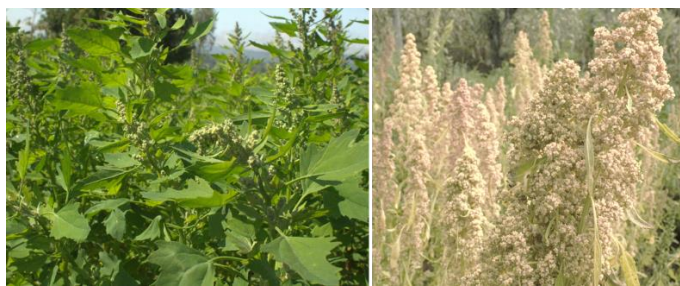
Figure 3. From left to right is Shisha at flowering and maturity stages, respectively, in Ngoma District, Eastern Province of Rwanda in 2022.

In February 2022 Shisha was sown in a 5 × 20 m strip at one of the QuinoaHub farms situated in Kigabiro Cell, Murama Sector, Ngoma District, Eastern Province for the elimination of off types. Identified off types were rogued and rows that appeared uniform and clean were harvested and bulked and planted in October 2022, creating foundation seed.