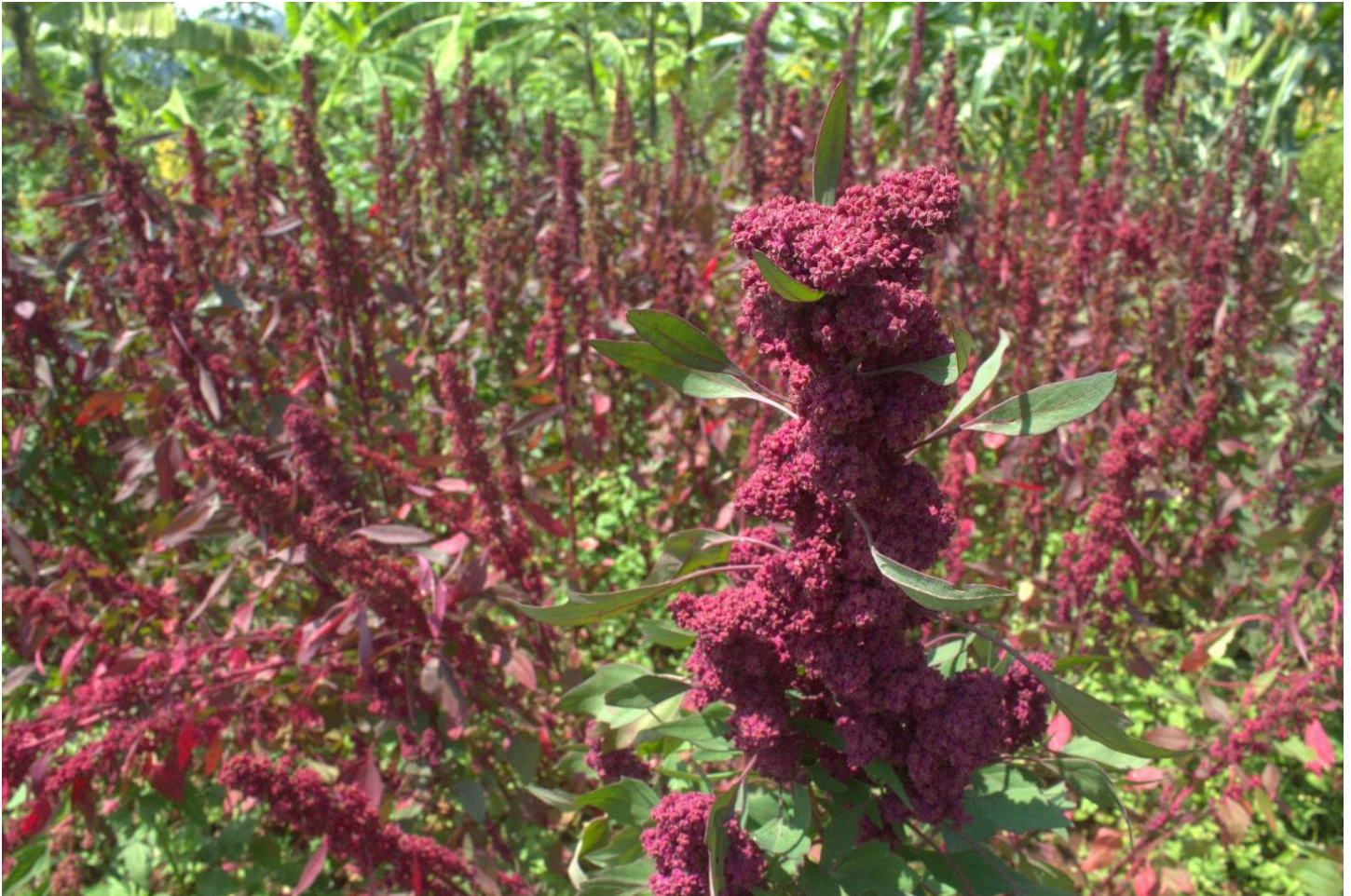
Figure 1. Cougar at maturity stage

‘Cougar’ (39-64) quinoa ( Chenopodium quinoa ) cultivar developed and tested as QuF9839-64, was co-released in 2023 by Washington State University (WSU) and Brigham Young University (BYU). The name ‘Cougar’ was chosen to reflect the decade-long collaborative efforts