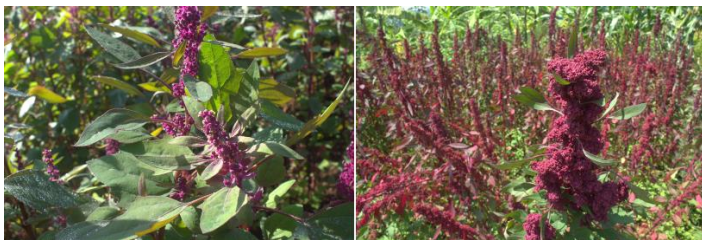
Figure 3. From left to right are Cougar at flowering and maturity stages, respectively, in Ngoma District, Eastern Province of Rwanda in 2022.

In February 2022, Cougar was sown in a 5 × 20 m strip at one of the QuinoaHub farms situated in Kigabiro Cell, Murama Sector, Ngoma District, Eastern Province for the elimination of off types. Identified off types were rogued and rows that appeared uniform and clean were harvested and bulked and planted in October 2022, creating foundation seed.